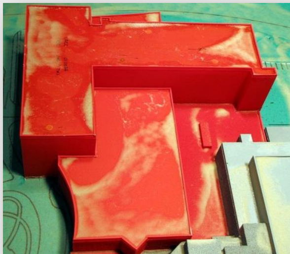
Example of Typical Snow Accumulation

Hybrid FAE: This approach provides comprehensive structural loading recommendations based on a combination of wind tunnel research into the wind velocity field over the shape of the roof and an hour-by-hour simulation of snow accumulation, drifting and ablation. Codes and standards allow for the use of this approach through endorsement of comprehensive methods including wind tunnels and water flumes.