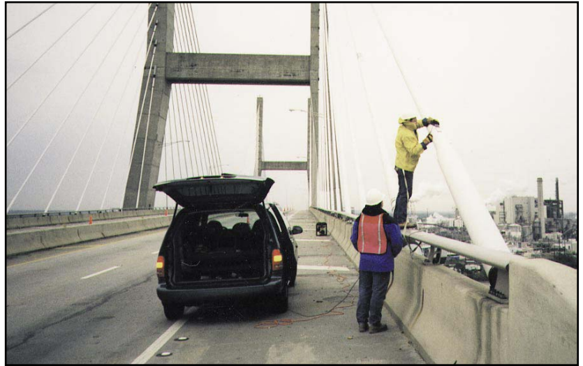
Figure 1: RWDI's field monitoring team undertaking measurements on bridge cables.

Rain-wind oscillations begin in the wind speed range of 7 m/s to 15 m/s and can reach amplitudes higher than a metre. Below this speed, the top rivulet does not form because the wind force is insufficient to prevent it from running downwards around the windward face to the bottom of the cable. Above this range, the wind forces on the rivulets are high enough to blow them right off the cable. Like vortex excitation, a range of vibration modes can be excited by rain-wind oscillations.