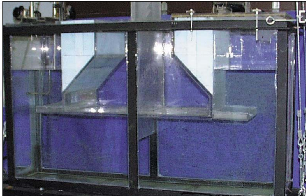
Figure 2: A scale model experimental set-up that was used to confirm the theoretical predictions for natural frequency and internal damping for a large 600 ton TLCD installation for a Vancouver building.

Viscous Damping System: Installing viscous dampers in a structure has long been recognized as an effective means of reducing the effects of wind and earthquakes. The benefits of a viscous damper are well known in the